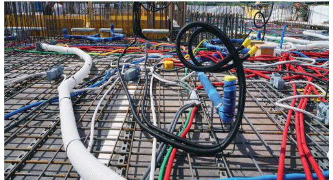
The iFIT pipes (black) are fitted for the drinking water supply to the apartments.