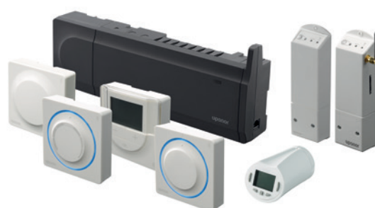
Smatrix Wave product line