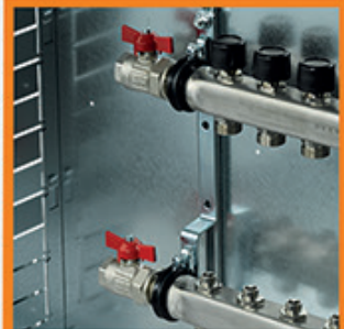
Horizontal without heat meter