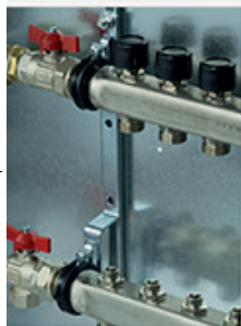
tical without heat meter