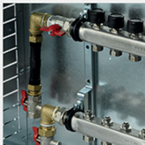
Vertical with heat meter